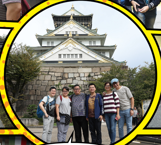
Visit Osaka Castle 大阪城觀光