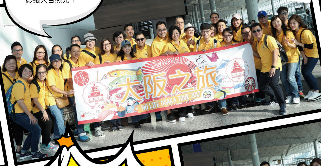
Set out to the 2017 Osaka trip! 2017 大阪之旅出發喇!