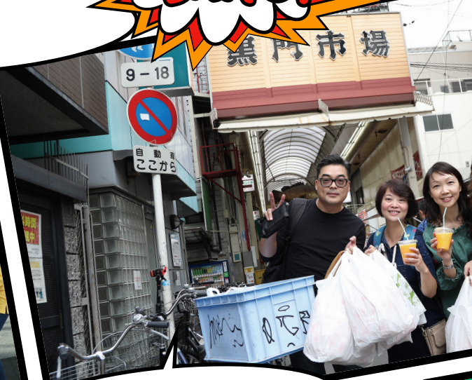
Crazy shopping! 大買特買!