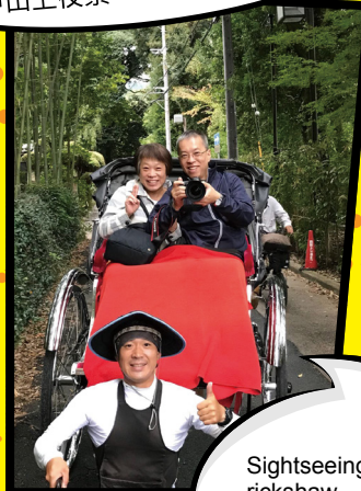
Sightseeing in rickshaw 人力車觀光