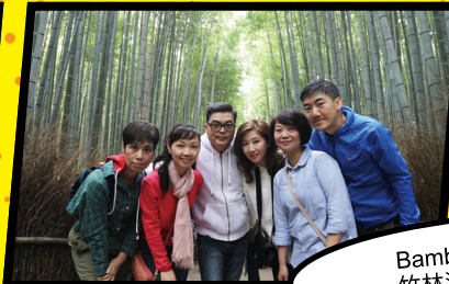
Bamboo walk 竹林漫步