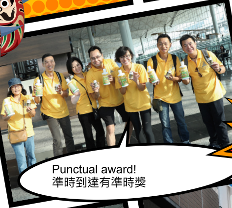
Punctual award! 準時到達有準時獎