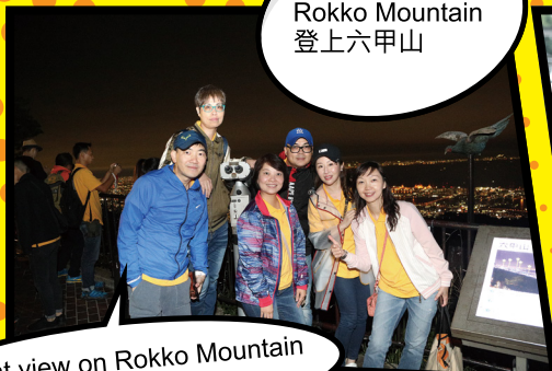
Night view on Rokko Mountain 六甲山上夜景