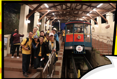
Rokko Mountain 登上六甲山